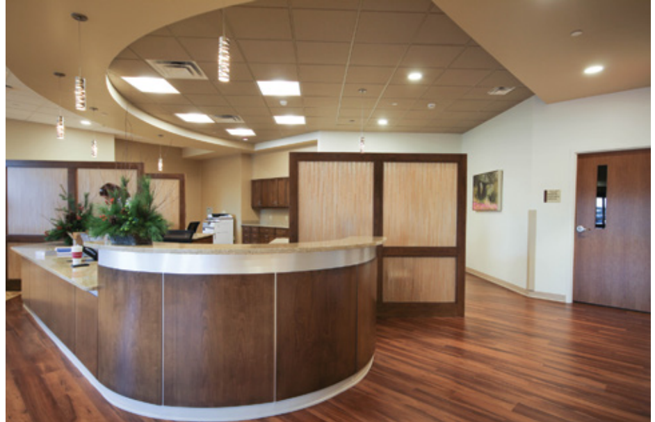
Sechler Family Cancer Center, Lebanon, PA