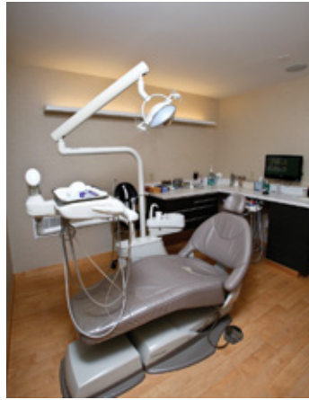
Private dental office, Scotia, NY