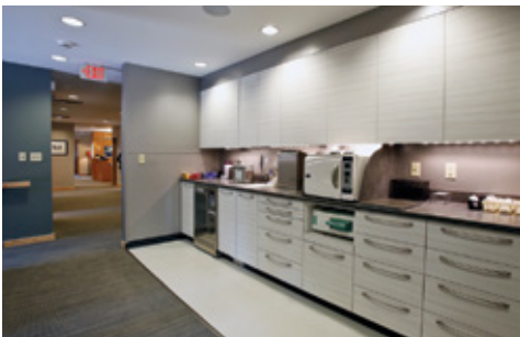
Private dental office, Scotia, NY

From new facility design to improving operations through commissioning, from energy studies to audits, our SustainabiliTEAM uses a custom approach to achieve optimal solutions in quality and sustainability. Save energy and money with Erdman Anthony's SustainabiliTEAM.