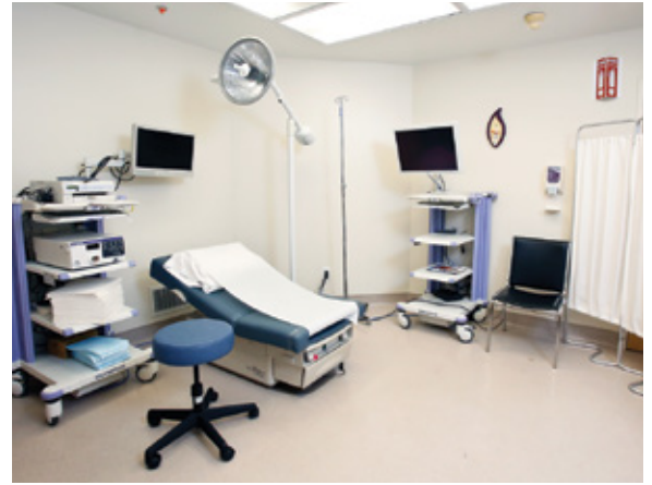
Saratoga Regional Urology Associates, Saratoga Springs, NY