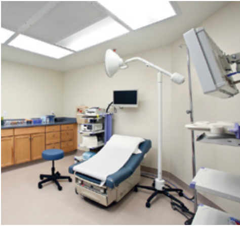
Saratoga Regional Urology Associates, Saratoga Springs, NY