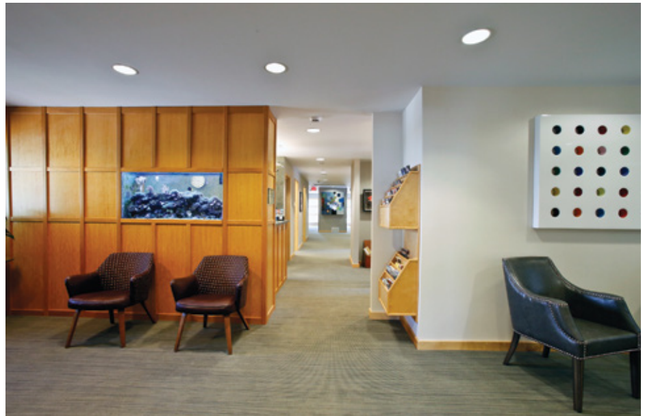
Private dental office, Scotia, NY

95% Our repeat business record is a testament to our award-winning expertise and technology. Count on us to work closely with you throughout the process, maintaining clear and frequent communication. It's essential for keeping your project on time, on budget, and synchronized with your goals.